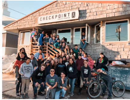
Marin Covenant Church youth group came to Nome in April for a spring break service trip. Our youth had an excellent time playing hockey ball and working alongside them.