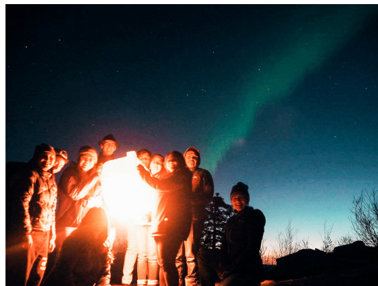
Aarigaa UAF lighting paper lanterns under the Northern lights celebrating the end of the year!

Checkpoint Youth Ministry had a very busy year full of changes. We celebrated our fifth birthday of the opening of our youth center located on Front Street in Nome, Alaska. We welcomed our long