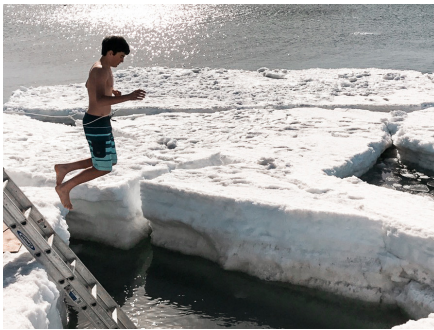
Living the dream. A local youth pastor suggested it would be a unique experience for the uninitiated to jump into the ocean after the ice broke up. Water temperature: 29 °F

This summer will see the construction phase of our workshop that will fill a discipleship and vocational education need that we have had for some time now. The din and activity of the youth center is not always the best place for one-one conversations. We have a lot of teens moving through the doorway of young adulthood without any drive or purpose. That's a very dangerous place to be for a young person here. So we are going to insulate a shipping container and outfit it to be a repair shop where I can spend focused time with smaller groups of students and teach bicycle and appliance repair. Please pray for the future of our graduates and the success of our building project.