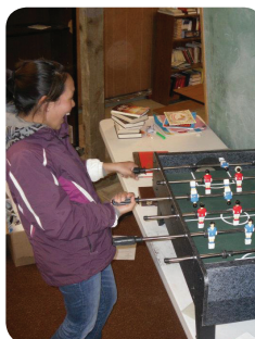
April : Mekoryuk YG