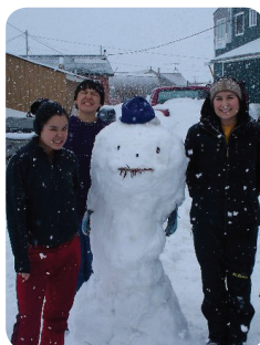
March : Unk YG