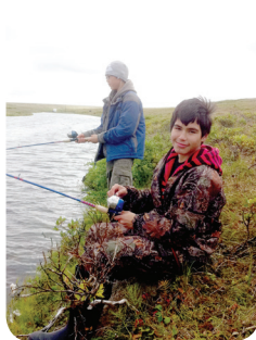
August : ANMP camp