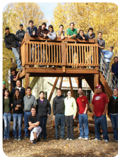
Sept : Arigaa Retreat