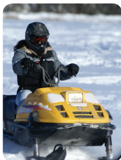
Feb : Retreats!