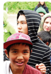
June : CBC