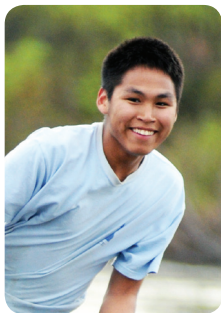
July: Loss of loved ones