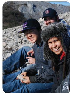
Oct : Fall Blast -Elim