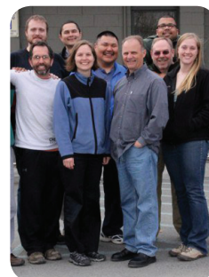
May : CYAK Planning