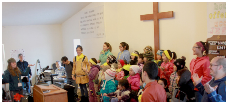
Unalakleet Youth Interns and Student Leaders led Children's Worship during the 2015 Annual Meeting in Elim.