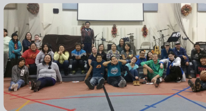
Arigaa Soldotna Kick-Off!