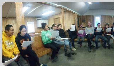
Scammon Bay Youth Group