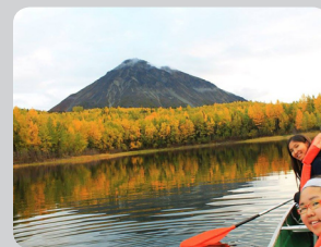
Chickaloon Retreat Center