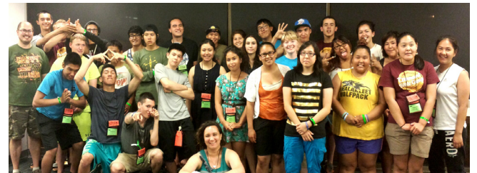
Unalakleet High Schoolers at the CHIC Conference in TN!

allows to grow. We have more outreach events and less regular program. Summer is a great time to build relationships.