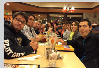
Arigaa Anchorage Pie Night