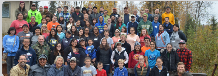
CYAK Young Adult Retreat!