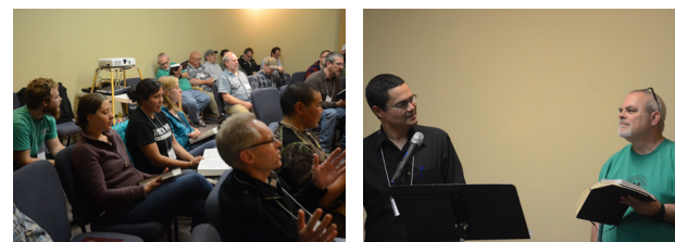
Evangelical Cov. Church of Alaska Pastor Leader Retreat