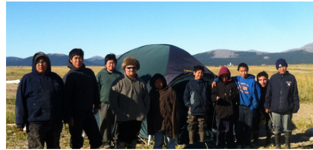
Subsist Mentoring Retreat in Elim