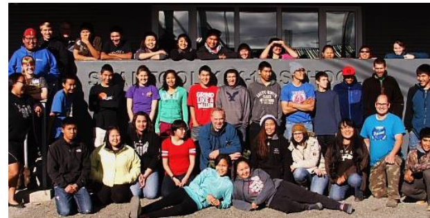
High School Fall Blast in Shaktoolik