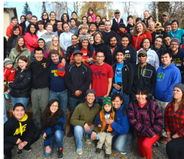
Young Adult Retreat in Big Lake