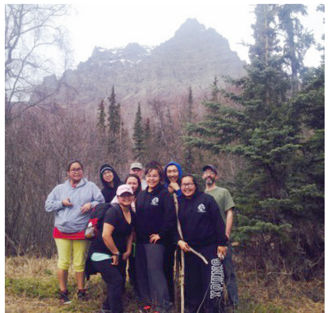
Spring Camp! Hiking up Castle Mountain at CRC in May.