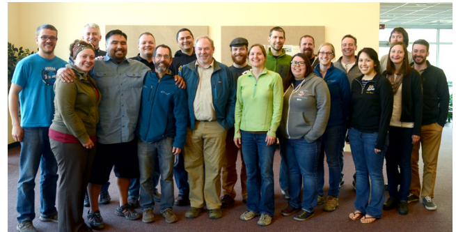
CYAK Board and Staff together at First Covenant Church in Anchorage.

In early May, the CYAK Board and Staff gathered together for a time of visioning and strategic planning. It was an encouraging weekend spent discerning together the direction God is leading CYAK. We were affirmed in acknowledging the ways that God has been at work, and were reminded of how to continue moving forward to reach youth and young adults with the love of Christ. Together, we are grateful for the broader team of churches, partners and supporters who are faithfully praying for and supporting CYAK as we continue to grow as a ministry. Quyana, thank you!