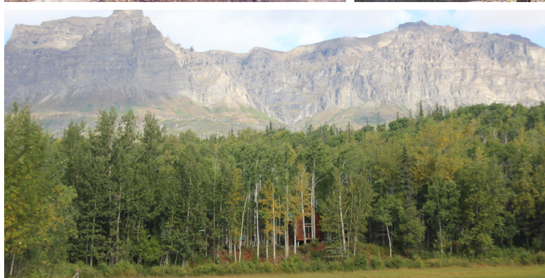
Chickaloon Retreat Center is a beautiful place! Alaska Christian College and Arigaa Anchorage young adults had an awesome time together at Spring Camp!