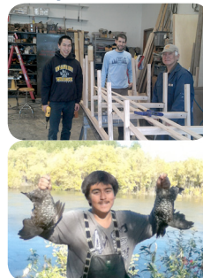
SUBSIST! Sled building and hunting this fall