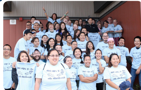
High School Fall Blast took place in the village of Golovin this year!