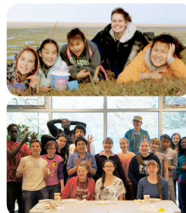
Local youth ministry in Scammon Bay and Anchorage