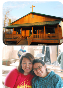
Leadership Week at Covenant Bible Camp