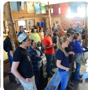
CYAK Staff, Board, and Team Strategic Planning and Team Building time together in Unalakleet