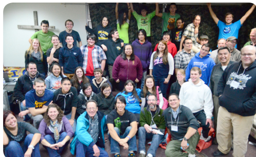
Arigaars and Pastors worship together at First Covenant in Anchorage during the ECCAK Pastor Leader Retreat