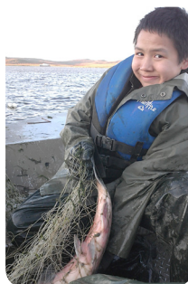
Fishing for salmon in late summer