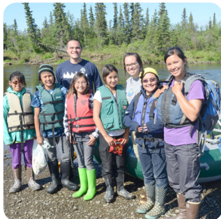
Rafting Trips led by CYAK Interns this summer