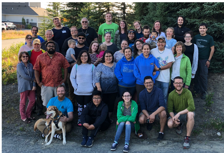
We are grateful for the time spent together at the CYAK Staff and Team Training in Soldotna last month. Please keep this team in your prayers!

Before we left CHIC in July we cast a vision that they would return home different students. That they would hear from God. That they would be given dreams and visions. We told them that if all they got out of it was a fun time and a good memory that it would not be worth it. Our students bought into that vision and grabbed hold of it, and it will be exciting to see where God takes them with the vision cast at this incredible event.