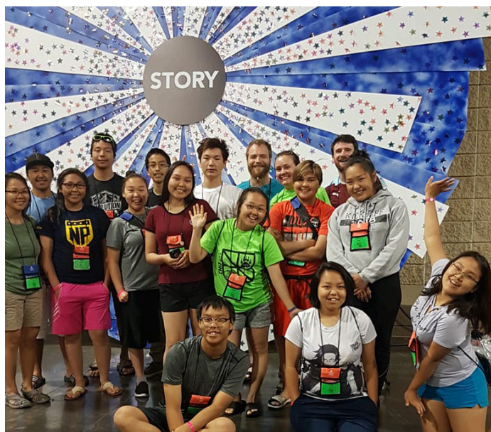
Students from the YK Delta Region of Alaska at CHIC.

CHIC 2018 cultivated an experience that resonated with all students who came. This is sometimes a rarity for our Alaskan, and particularly Western Alaskan students, who come from a particular context that all too often gets forgotten by wider culture and by our Church. Not so this year. It was so clear that our students resonated with everything that CHIC had to offer. From the morning sessions, to the afternoon options, to the mainstage evening speakers and worship, our students basked in the goodness of what God has to offer them, catching glimpses of the people they were always meant to be.