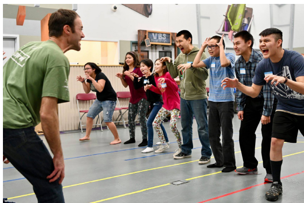
Youth play a group game at Native Musicale through the partnership outreach event with CYAK and InterAct Ministries.