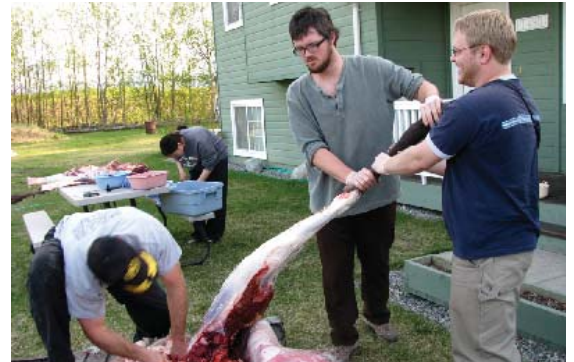
North Park crew getting some moose meat for bible camp.