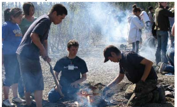
Senior High Camp eco-challenge.