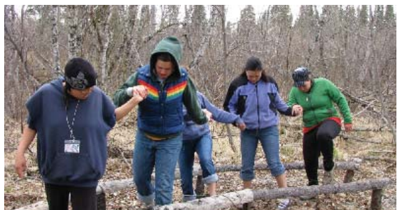
Leader's for Life trust walk.