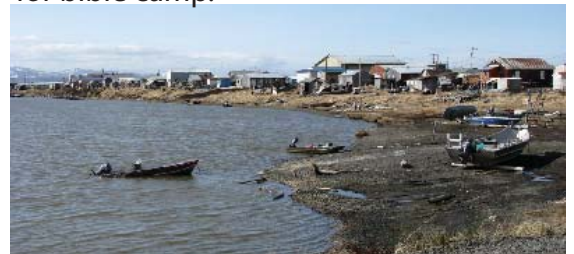
Village of Unalakleet, where Covenant Bible Camp is near.