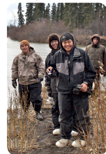
Dec : Program funding from NSEDC celebrated!