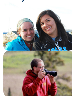
May : CYAK Summer Internships begin