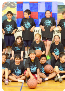
July: Sports Camps run by CYAK Interns