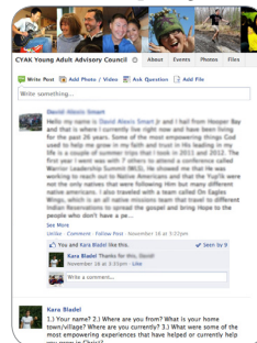
Nov : Launch of Young Adult Advisory Council