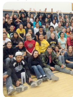
Oct : Sr. and Jr. High Fall Blast - Koyuk and Elim