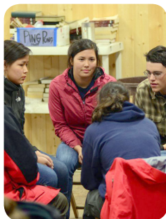
August : CYAK Prayer and Planning Retreat