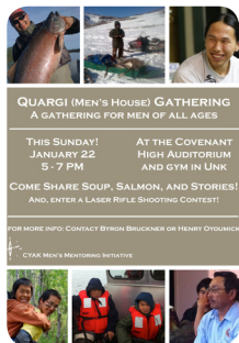
QUIARGI (Men's House) GATHERING A GATHERING FOR MEN OF ALL AGES