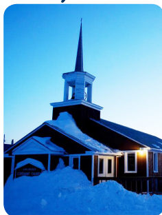
March : ECCAK Annual Meeting in Unalakleet