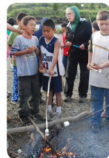
June : Covenant Bible Camp in Unalakleet