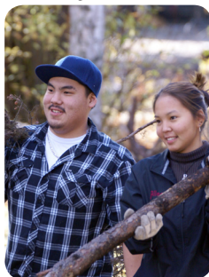
Sept : CYAK Young Adult Retreat in Big Lake