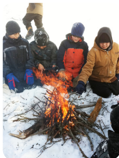
Feb : Mentoring Retreat - White Mountain