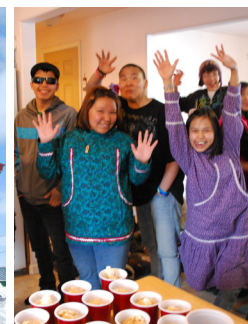
Root Beer Floats!