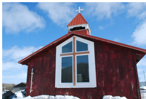
Mekoryuk Covenant Church

We need more supporters for our youth group, more adult involvement and more youth to come to understand what youth group is all about.