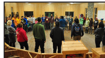
Norton Sound Fall Blast in Unalakleet.