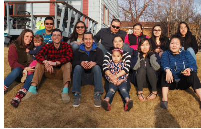
Arigaa Fairbanks! We began a third Arigaa community this fall in Soldotna!