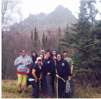
1st Annual Spring Camp at Chickaloon Retreat Center.