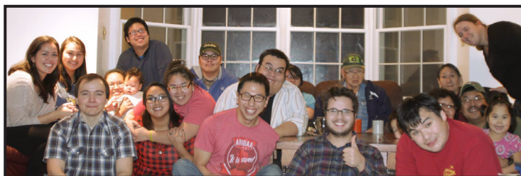
Arigaa Anchorage Thanksgiving Celebration!