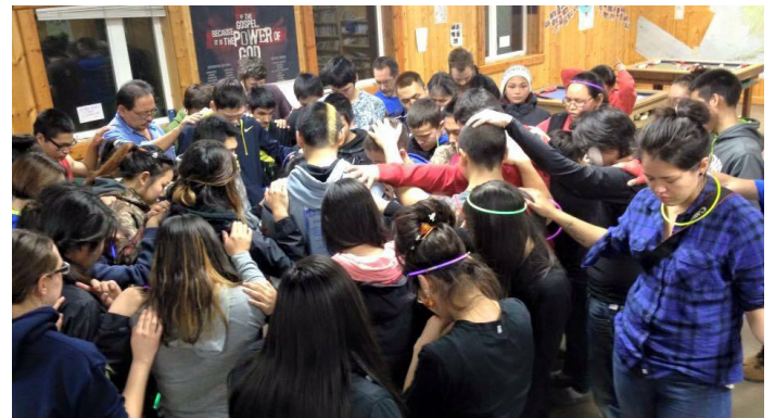
Those who had come to Hooper Bay for the CYAK Cares weekend gathered around the youth to pray for them. It was a hope-filled time.

The reality is we cannot do this without partners. We are very thankful that God continues to provide through you and others to help us reach out. May we continue to fulfill the Great Commission together. Matthew 9:36-38, "When he saw the crowds, he had compassion on them, because they were harassed and helpless, like sheep without a shepherd. Then he said to his disciples, 'The harvest is plentiful but the workers are few. Ask the Lord of the harvest, therefore, to send out workers into his harvest field.'"