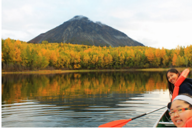
Arigaa Anchorage student leaders at the Chickaloon Retreat Center this fall.