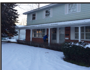
The New Arigaa House.