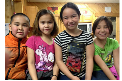
Kids at the carnival during CYAK Cares weekend in Hooper Bay.