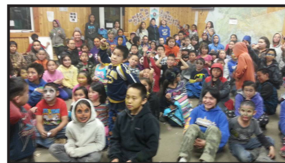
Face painting and fun times at the Carnival in Hooper Bay during the CYAK Cares weekend.