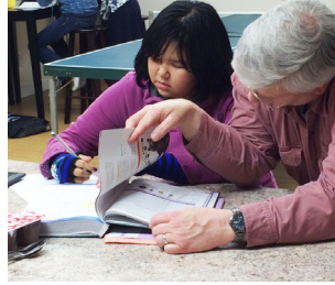
Tutoring Nights at Checkpoint Youth Center in Nome.