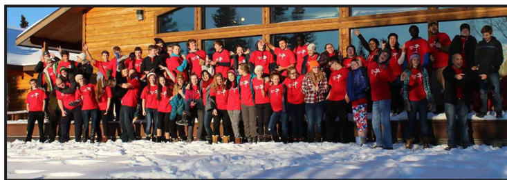
Group picture at the Road System Retreat.