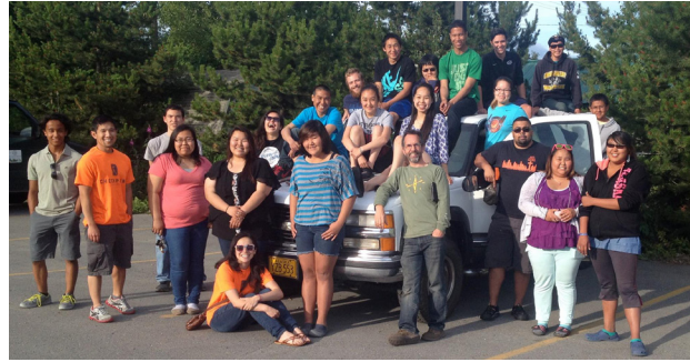
Western Alaska High Schoolers heading to the Covenant denomination's CHIC Conference in Tennessee this July.