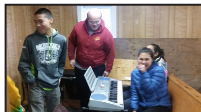
Scammon Bay Youth Group Song!