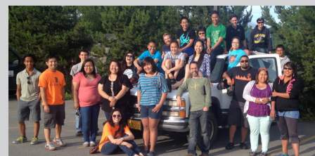
CHIC was awesome! Left: Western AK crew