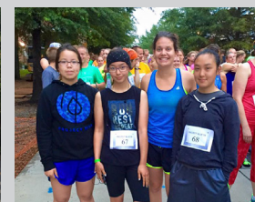
Right: CHIC 5K Runners!