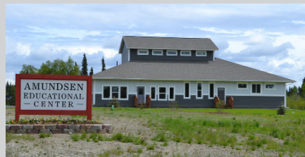
Left: AEC's campus in Soldotna