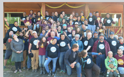
Over 35 young adults from across Alaska came to Leadership Camp!