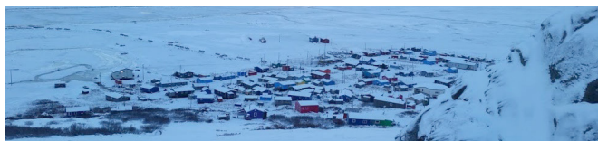
Top to bottom: singing together at youth group, crazy games and popcorn, a view of Scammon Bay in the winter.